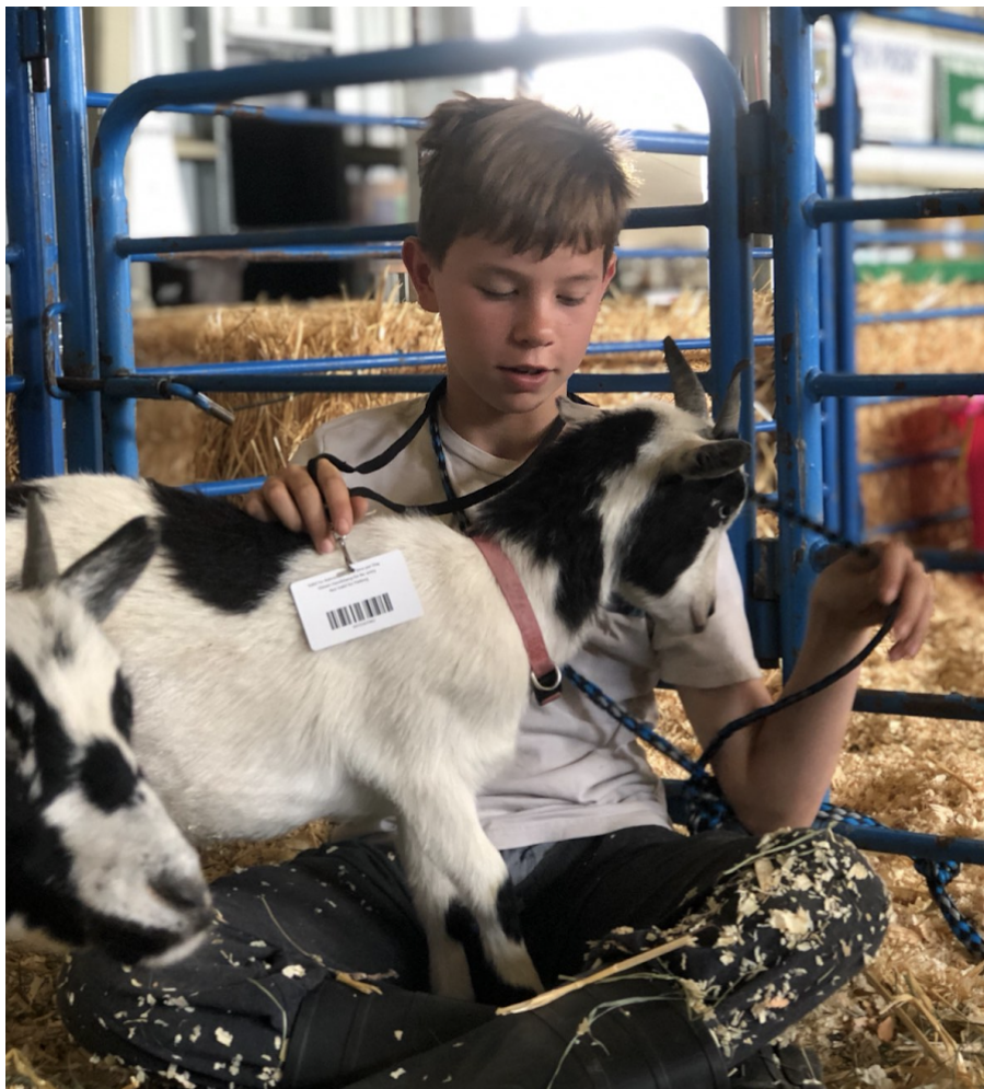
Posted by: Kelly Steitz